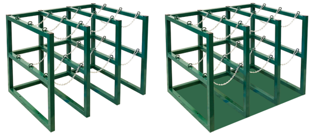
MCR-900 & MCR-900-BP