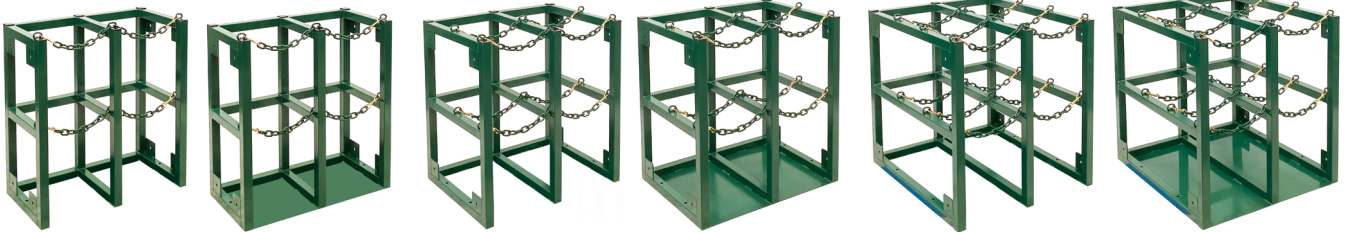
MCR-200 & MCR-200-BP