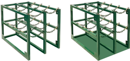
MCR-800 & MCR-800-BP